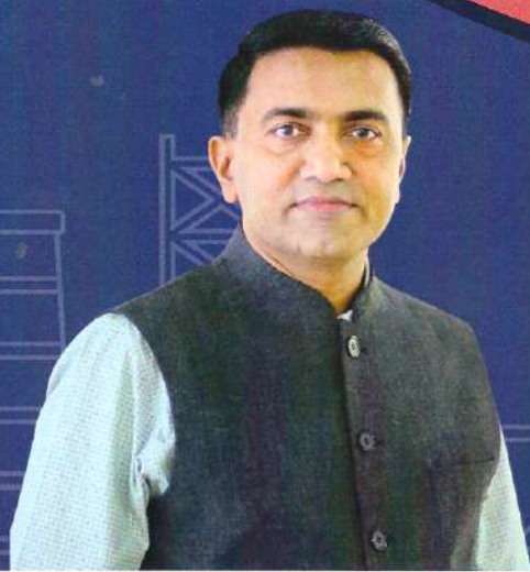
Dr. Pramod Sawant Hon'ble Chief Minister of Goa