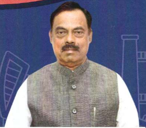
Shri Nilkanth Halarnkar Hon'ble Minister for Fisheries, Animal Husbandry and Veterinary Services, Factories and Boilers